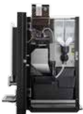
OPTIBEAN 3 (XL) TOUCH