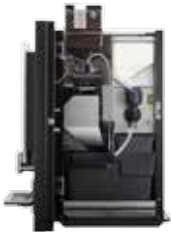
OPTIBEAN 2 (XL) TOUCH