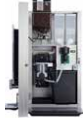
OPTIBEAN 3 (XL)