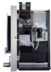
OPTIBEAN 2 (XL)